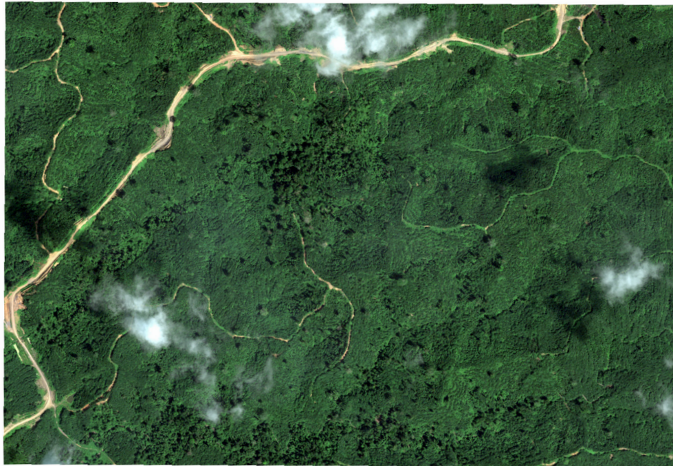
Graphic 3. High resolution imagery (50 cm) of select area inside PT Fajar Surya Swadaya's concession from 2017 showing pulpwood plantation.